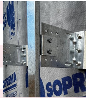
Vertical Z-Girt Outside the Insulation