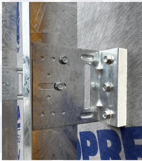
Vertical Angle Penetrating the Insulation