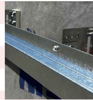
Horizontal Z-Girt Outside the Insulation

Adjustable: Save time and avoid shims with adjustability up to 1" in applications with penetrating angle.