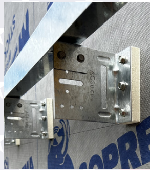
Horizontal Angle Penetrating the Insulation